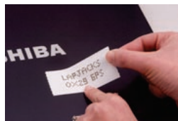
Stick label onto laptop