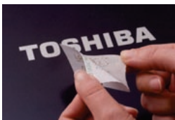
Peel backing off label