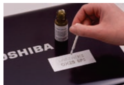
Paint on etching liquid